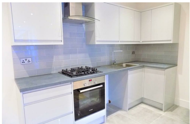
Oak House, Harvest Crescent, Fleet